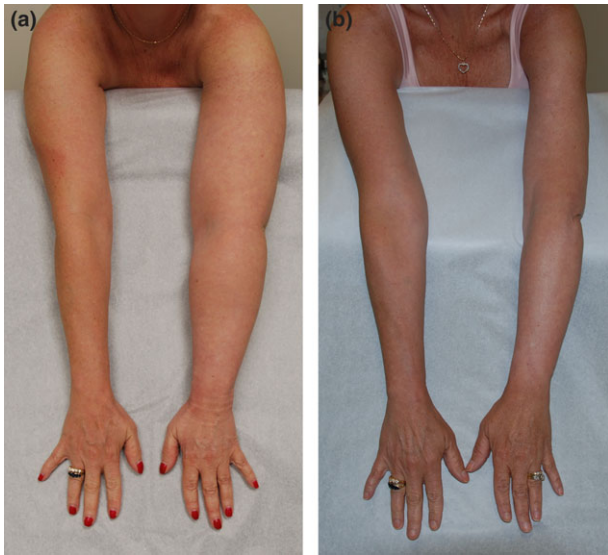
Figure 1. (a) Patient 1 with 4-year history of chronic, non-compressible lymphedema of the left arm after maximum reduction possible with conservative therapy. (b) Patient 1 following staged SAPL and VLNT.

identical to the unaffected right side. However, maintenance of the volume reduction required continuous compression to prevent fluid reaccumulation.